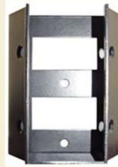
SDRC Stair Rail Connector for standard 2x4 rail