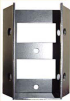
SDRC Deck Rail Connector for standard 2x4 rail